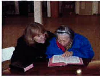
Bible Study 查經