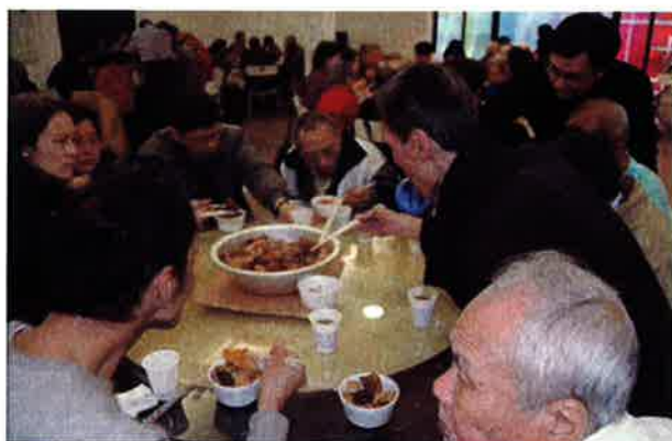
Social Activity 社交活動