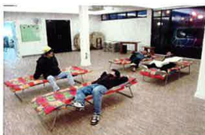
Temporary Shelter 臨時庇護