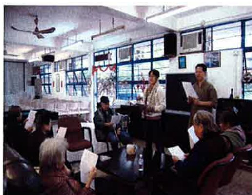
Fellowship 團契小組 (詩歌分享)