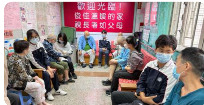
ST. PAUL'S CO-EDU 同學探訪老人院，讓老友記感受到被關心。Students from St. Paul's Co-Edu visited the elderly home, allowing our elderly friends to feel cared for.