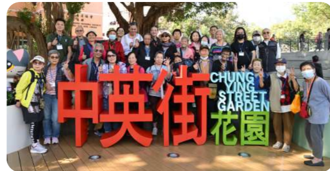
中心秋季旅行，與會員同遊沙頭角。Autumn outing: Taking members to Sha Tau Kok.