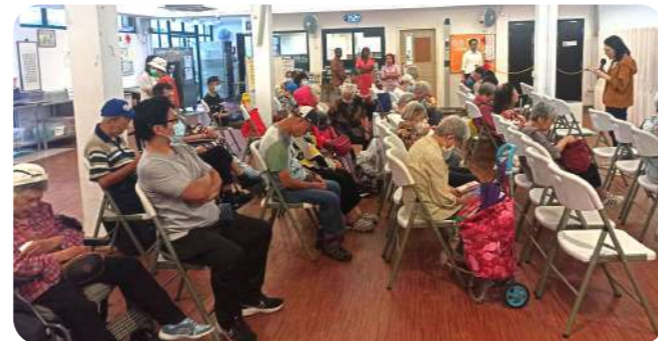
所羅門長廊教會帶領活動，讓老友記渡過快樂的下午。Volunteer from Solomon's Porch led the activities, giving our members a happy Sunday afternoon.