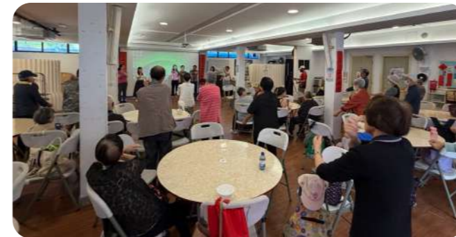
St. Andrew's Church 與老友記查經及派飯。St Andrew's Church volunteers led our members in Bible study and served them lunch