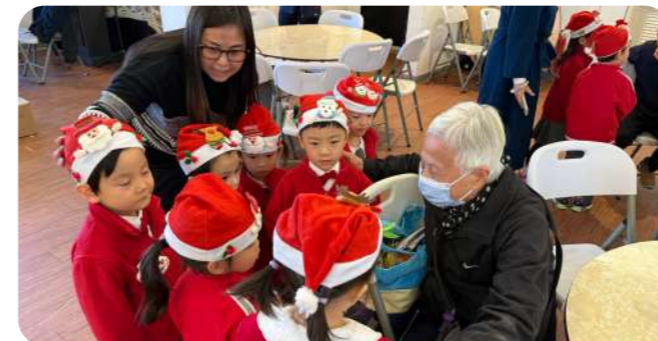
寶翠園維多利亞幼稚園學生到訪，表演及關心老友記。Students from Victoria (Belcher) Kindergarten visited, performing for our members and showing them care.