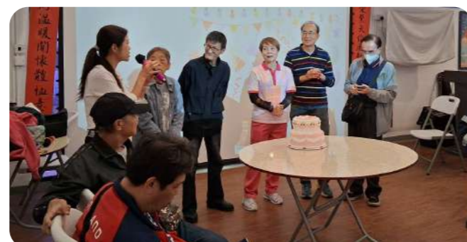
週五開心聚一聚舉行生日會，與老友記慶生，讓他們知道自己被記念。On Friday gathering, we held the final birthday celebration of 2025, marking members' birthdays with them and showing that we care.