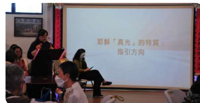
Union Church 帶領查經，讓老友記明白聖經真理。To help our members better understand the Bible, Union Church volunteers thoughtfully led that day's Bible study.