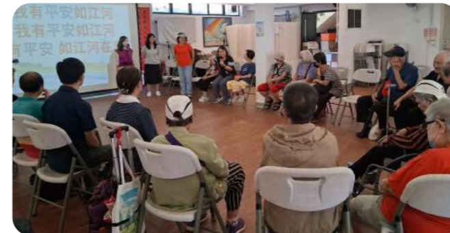
旺角浸信會帶週日活動。Mong Kok Baptist Church volunteers came to the Centre to lead Sunday activities.